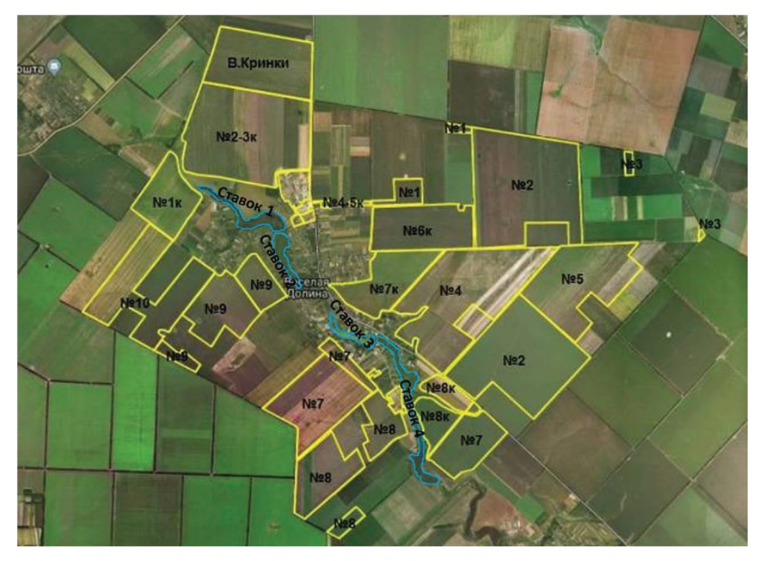
Fig. 1. Scheme of field location within the land plots used by Promin-Lan LLC and ponds on the Manzhelia River near the village of Vesela Dolyna of the Kremenchuk district in the Poltava region

Research results and their discussion. The performed hydrological calculations show that the natural runoff of the Manzhelia River is characterized by significant unevenness of its distribution throughout the year. The spring period accounts for more than 70% of the annual runoff, while in the summer months, it is less than 5%. It was determined, that under the influence of a complex of anthropogenic factors, the river