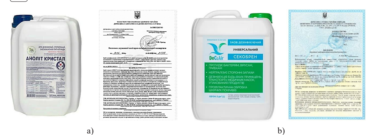
Fig. 1. Domestic environmentally safe, electrochemically activated low-concentration substances in commercial containers and permits for their production: