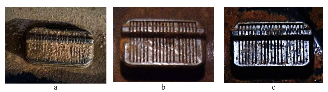
Fig. 4. The appearance of the drippers from the side of the inlet filter: a - before flushing; b, c - after flushing