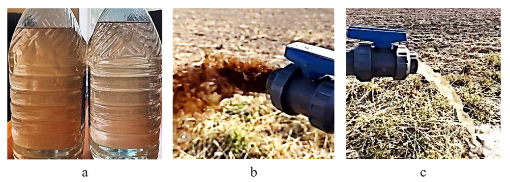
Fig. 3. Visual assessment of the quality of flushing of subsurface drip irrigation pipelines in the field: a – in 5-liter containers; b – at the beginning of the pipeline discharge after flushing; c – at the end of the pipeline discharge after flushing

Figure 5 shows that the main labyrinth (No.1) is completely cleaned of contaminants after the droppers are washed. Some contaminants that do not affect the performance of the droppers may remain in the outlet chamber of dropper No. 2. It should be noted that, according to the observations of IRRIGATOR UKRAINE LLC specialists,